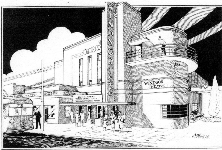
Windsor Theatre, Nedlands Architect: W T Leighton (1937) Drawing by Ron Facius 2006